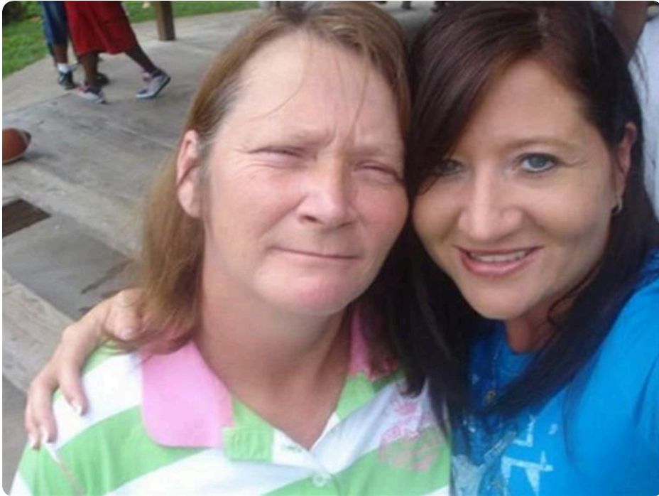
My first and favorite memories were with you and mamaw where I stayed with you all, all the time....