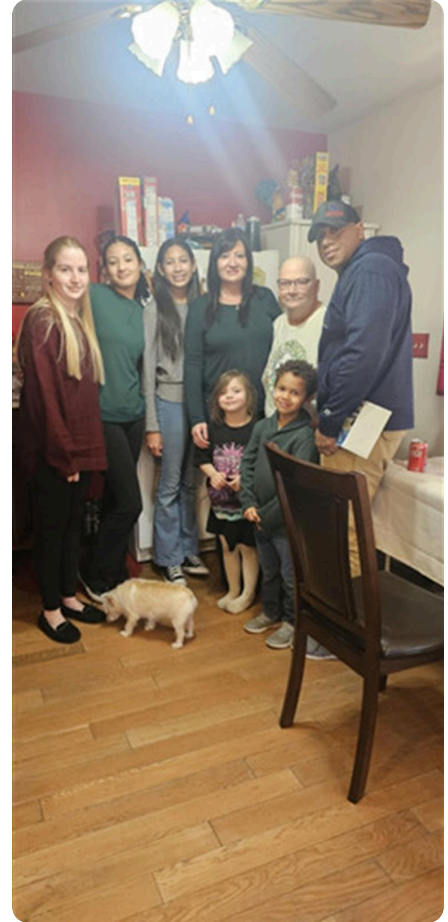
My first and favorite memories were with you and mamaw where I stayed with you all, all the time....