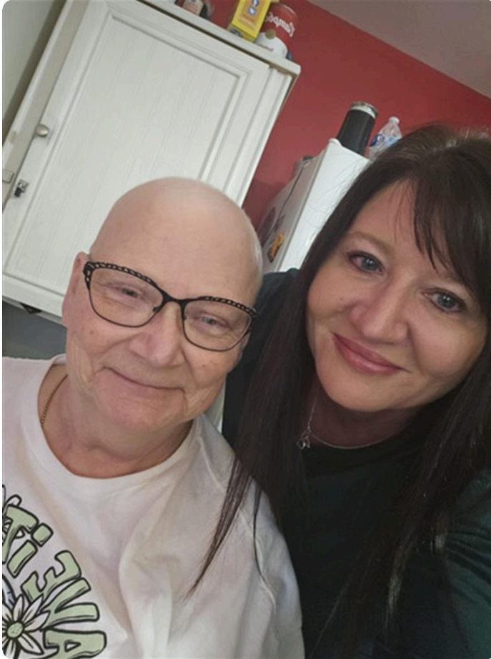
My first and favorite memories were with you and mamaw where I stayed with you all, all the time....